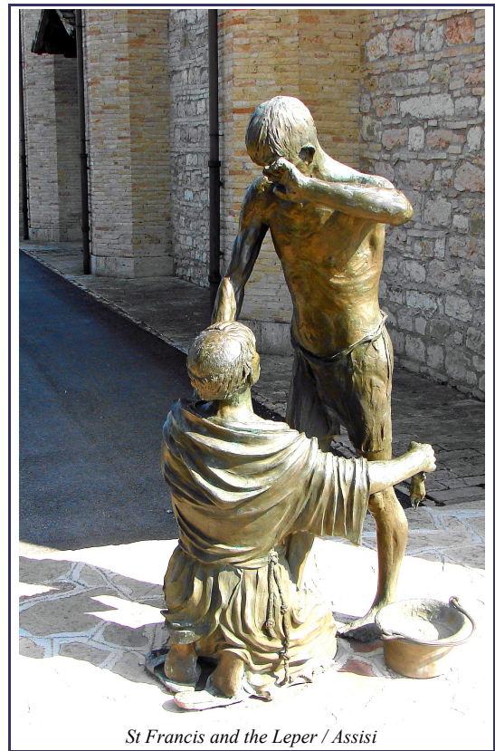
St Francis and the Leper / Assisi

in New Mexico, Ohio, Louisiana, and Missouri, as well as serving at the Franciscan novitiate and in the provincial administration.